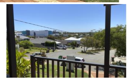
Quiet Street - Beautiful home. 3 \times 1 with Workshop and garage.

This great family home is very well situated in an elevated position and has great views from the front balcony area.