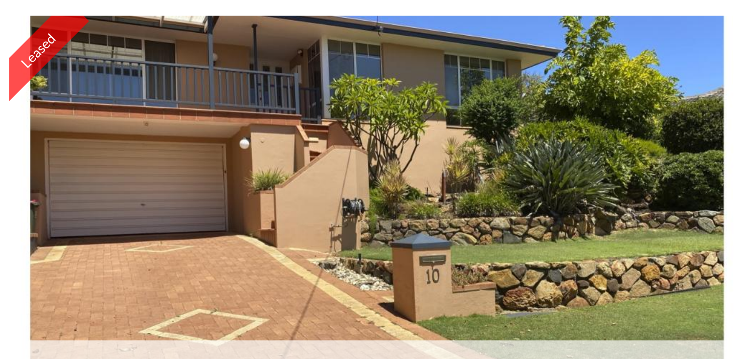
10 Hadley Pl, Karrinyup