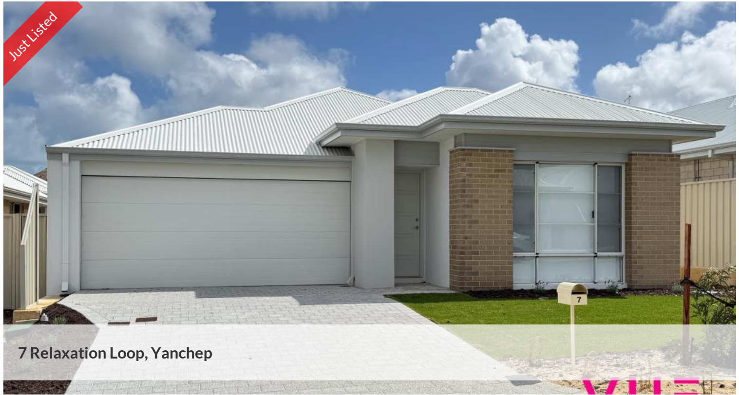
7 Relaxation Loop, Yanchep