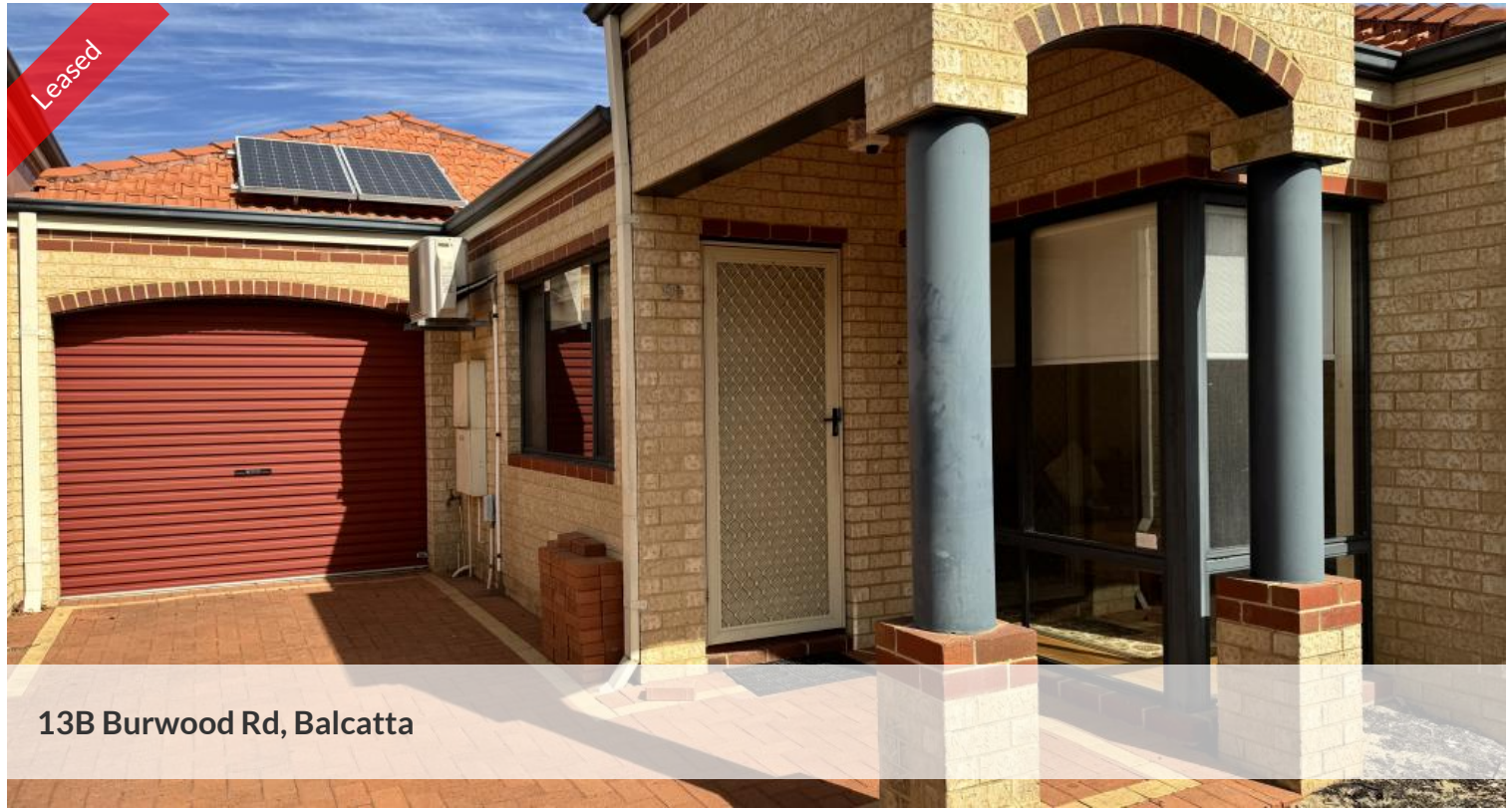
13B Burwood Rd, Balcatta