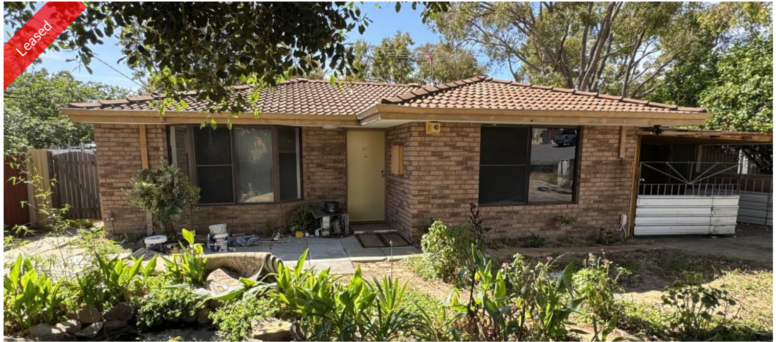
7 Twining Pl, Mirrabooka