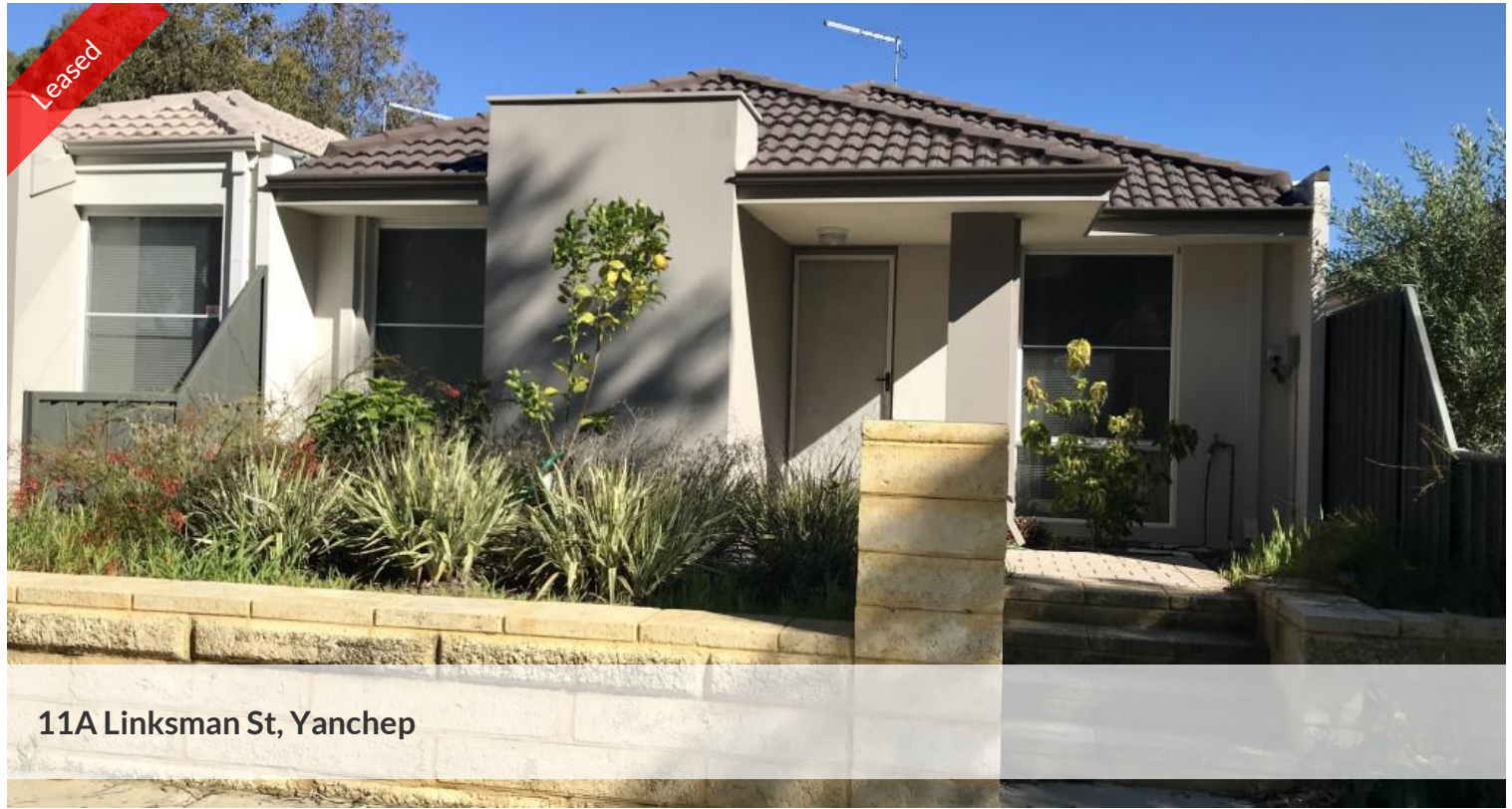
11A Linksman St, Yanchep